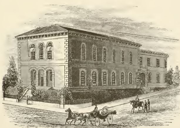
NEW ANTIQUARIAN SOCIETY HALL.

to be too small and too damp for the proper preservation of the rapidly accumulating collections, the present hall on Main Street was built in 1853. It is favorably situated in a locality free from dampness and is believed to be substantially safe from fire, besides being much better adapted than the first to the purposes of the society. Owing, however, to the rapid increase of the library—particularly of the department devoted to newspapers—it was found insufficient in size, and more space was soon required. The Hon. Stephen Salisbury, then the president, had anticipated this need, and presented a lot of land on Highland Street, in the rear of the building, and also provided funds for the erection of the addition, which was completed in January, 1878.